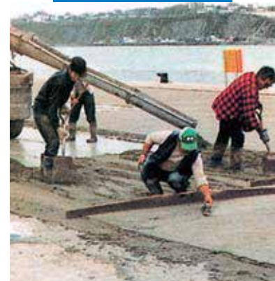
Exterior flooring with concrete admixed with Planicrete SP.