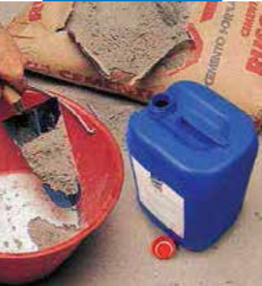
Mixing cement mortar with Planicrete SP for tile fixing