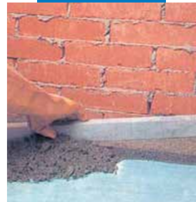
Applying cement screed modified with Planicrete SP