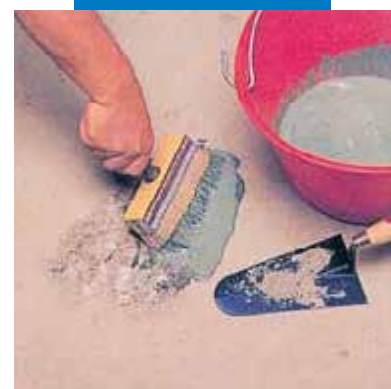
Floor patching: application of slurry