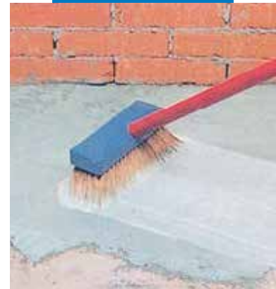
Applying cement slurry modified with Planicrete SP