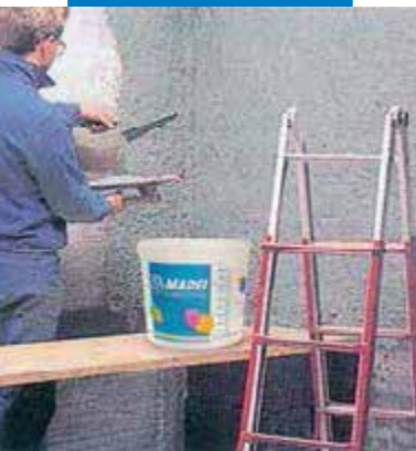
Wall render admixed with Planicrete SP