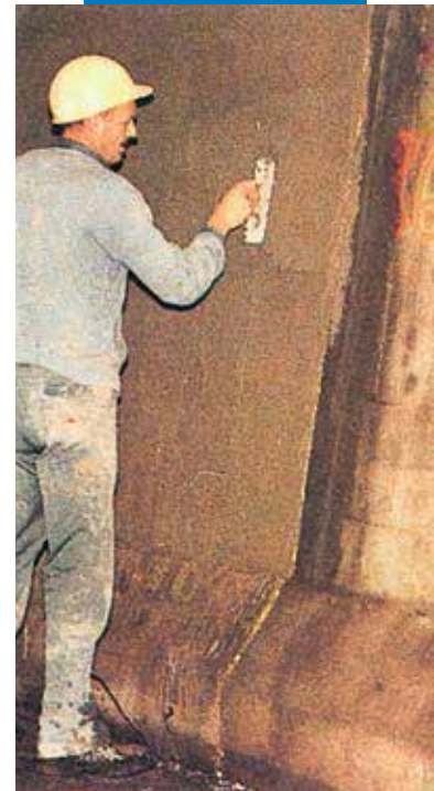
Cement plaster with Planicrete SP.

All relevant references of the product are available upon request