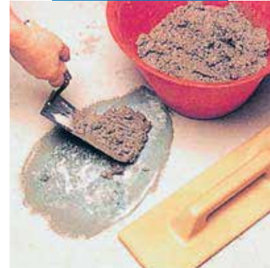
Floor patching: application of mortar

Tools and hands can be cleaned with water before the mix dries. Cleaning is very difficult after the mix has dried; solvents, such as white spirit, may be helpful.