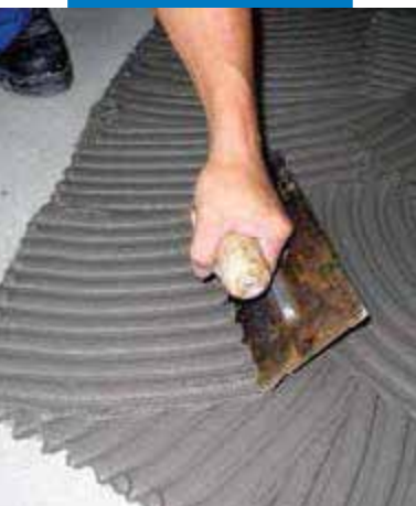
FIXING OF TILES Apply the adhesive onto the prepared substrate using a notched trowel. Do not spread more than 1m 2 at a time.